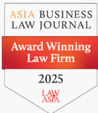
Asia Business Law Journal's 2025 Indonesia Law Firm Awards (2025) – Litigation