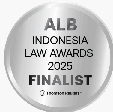
ALB Indonesia Law Awards (2025) – Dispute Resolution Boutique Law Firm of the Year