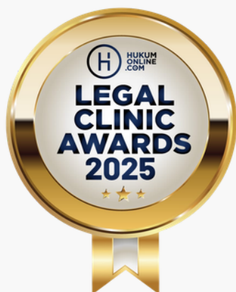
Hukumonline (2025) – Legal Clinic Awards in the category of Labor and Employment