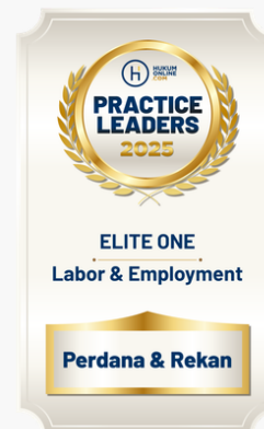
Hukumonline (2025) – Practice Leaders Elite One in the category of Labor and Employment