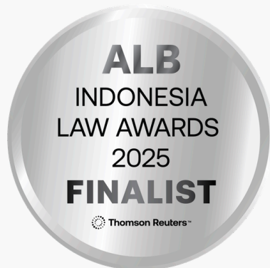
ALB Indonesia Law Awards (2025) – Rising Law Firm of the Year